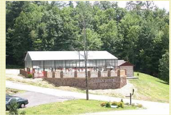
Walking distance to The Cubby Den

Make yourself right at home, even before you arrive! Right at your fingertips, you can find all your favorite family fun spots and map out your family's vacation time in advance at www.knorrproperties.com