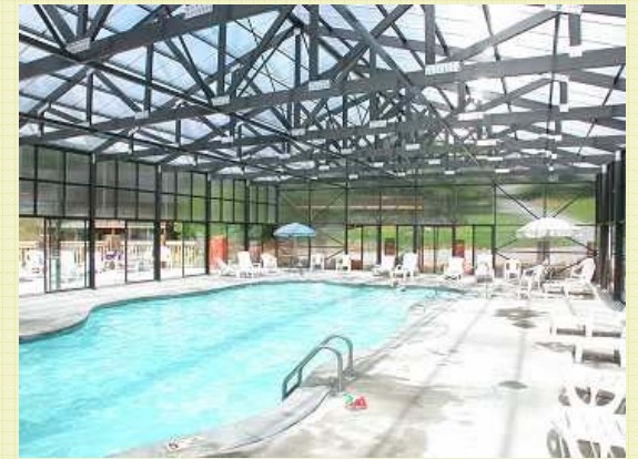
Patios & Chairs located poolside

Hidden Springs Resort offers guests the use of a beautiful covered outdoor pool year around. Enjoy a cool refreshing dip in the summer and a warm cozy swim in the winter.