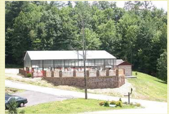
Walking distance to The Cubby Den

Make yourself right at home, even before you arrive! Right at your fingertips, you can find all your favorite family fun spots and map out your family's vacation time in advance at www.knorrproperties.com