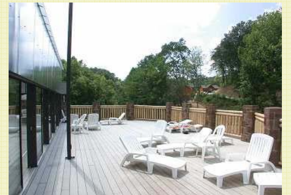
Relax on the Large Sundeck