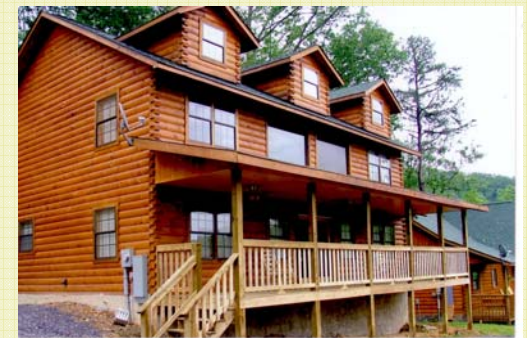
Front view of Cabin

Our Home Away From Home in the Smoky Mountains