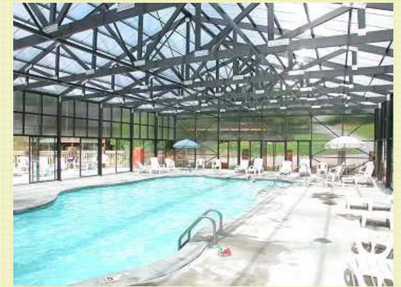
Patios & Chairs located poolside

Hidden Springs Resort offers guests the use of a beautiful covered outdoor pool year around. Enjoy a cool refreshing dip in the summer and a warm cozy swim in the winter.