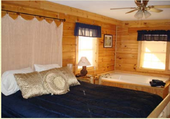
Master Bedroom with Jacuzzi Whirlpool Tub

The Cubby Den is conveniently located just 37 miles southeast of Knoxville, Tennessee in scenic Pigeon Forge at the gateway of the Great Smoky Mountains National Park. The Cabin is only 1.5 miles past Dollywood and Dollywood Splash Country and is located at Hidden Springs Resort, one of the finest luxury cabin resorts in the Smokies.