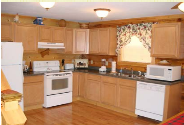
Large Open Kitchen—Perfect for Entertaining

The Cubby Den is conveniently located just 37 miles southeast of Knoxville, Tennessee in scenic Pigeon Forge at the gateway of the Great Smoky Mountains National Park. The Cabin is only 1.5 miles past Dollywood and Dollywood Splash Country and is located at Hidden Springs Resort, one of the finest luxury cabin resorts in the Smokies.