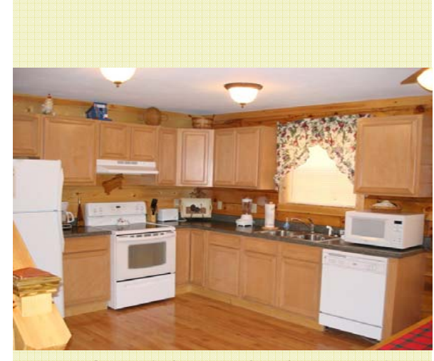
Large Open Kitchen—Perfect for Entertaining

The Cubby Den is conveniently located just 37 miles southeast of Knoxville, Tennessee in scenic Pigeon Forge at the gateway of the Great Smoky Mountains National Park. The Cabin is only 1.5 miles past Dollywood and Dollywood Splash Country and is located at Hidden Springs Resort, one of the finest luxury cabin resorts in the Smokies.