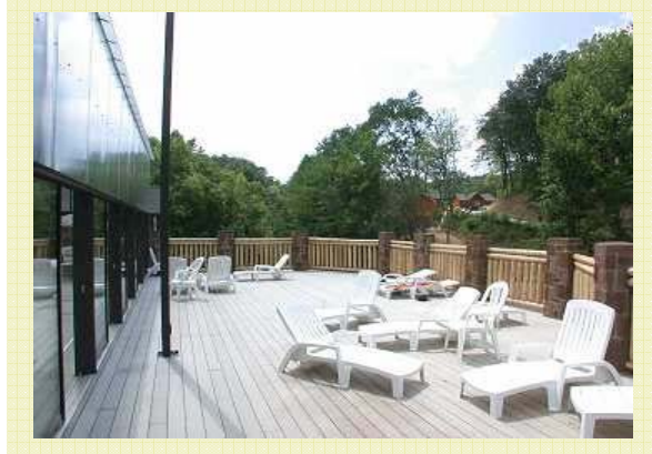
Relax on the Large Sundeck