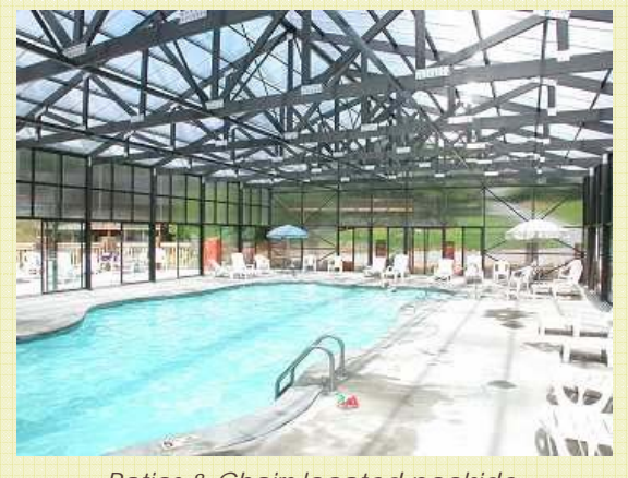
Patios & Chairs located poolside

Hidden Springs Resort offers guests the use of a beautiful covered outdoor pool year around. Enjoy a cool refreshing dip in the summer and a warm cozy swim in the winter.