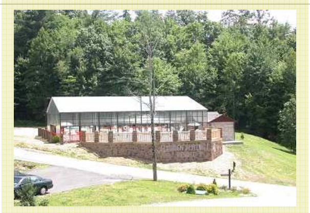
Walking distance to The Cubby Den

Make yourself right at home, even before you arrive! Right at your fingertips, you can find all your favorite family fun spots and map out your family's vacation time in advance at www.knorrproperties.com