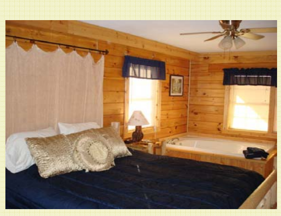
Master Bedroom with Jacuzzi Whirlpool Tub

The Cubby Den is conveniently located just 37 miles southeast of Knoxville, Tennessee in scenic Pigeon Forge at the gateway of the Great Smoky Mountains National Park. The Cabin is only 1.5 miles past Dollywood and Dollywood Splash Country and is located at Hidden Springs Resort, one of the finest luxury cabin resorts in the Smokies.